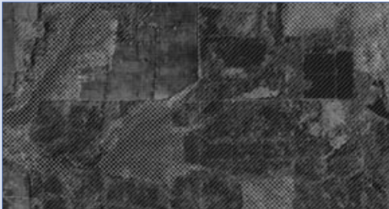
Image 3: Cumulative Delineation of Forest Cover. Areas hatched with crossing lines have been continuously forested since 1944. Areas hatched with parallel lines were forested for part of the time since 1944. Areas identified by dots have been fields since 1944.