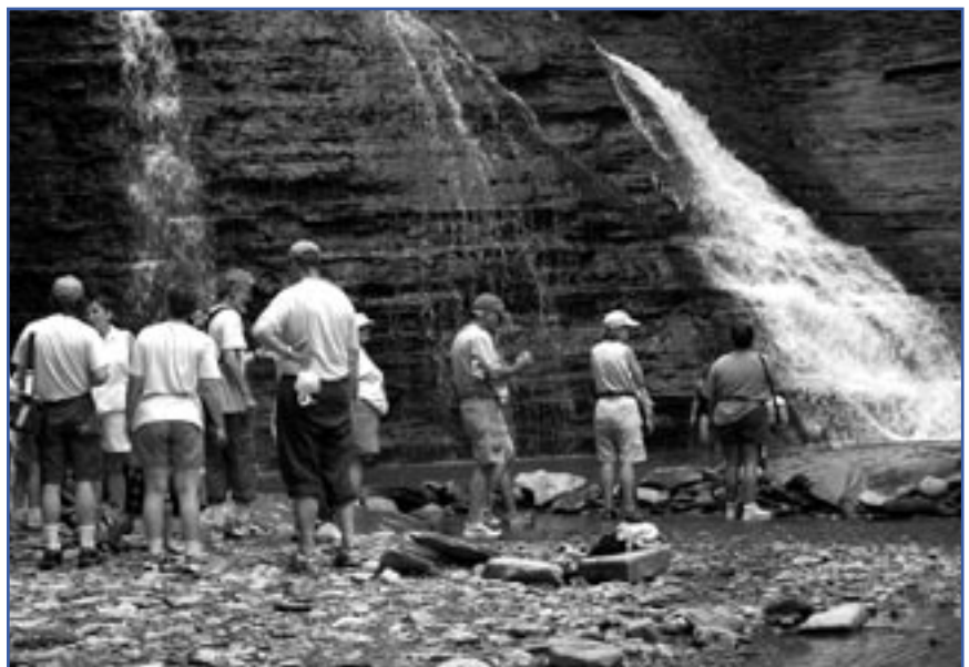
Visitors to Grimes Glen near Naples, NY.

A quality ecotourism experience might encourage an individual to start a local conservation project, a water quality monitoring project, or advocate for other environmental issues in his or her own community.