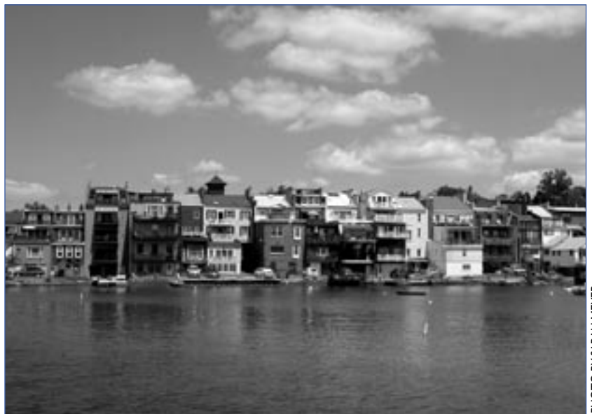
Skaneateles Lake shoreline.

The Institute's programmatic areas (Research, Community and Educational Outreach, Economic Development and Regional Planning) explore the unique role of water in building economic viability; they accomplish this through a series of initiatives that also foster