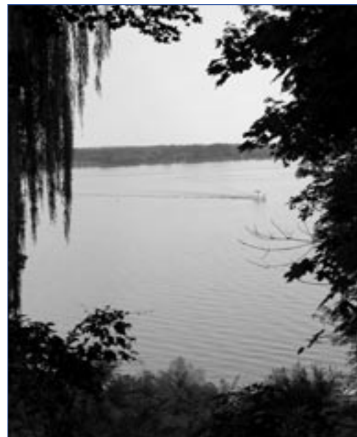
Eastern view of Seneca Lake from the FLI.

Construction of a storage facility on the campus of Hobart and William Smith Colleges for The J.B. Snow , a 25-foot pontoon boat for ancillary research on the Finger Lakes (acquired in 2004 with funding from the J.B. Snow Foundation and the U.S. Department of Education through the courtesy of Congressman James Walsh), will also be completed as part of this capital initiative. Used almost daily during the active research schedule on the Finger Lakes, The J.B. Snow is fully equipped to undertake water monitoring and sediment sampling. Until now, however, when not in use, the boat was kept in the campus parking lot. The new facility will house the boat, the trailer, and other field equipment currently held or that will be acquired.