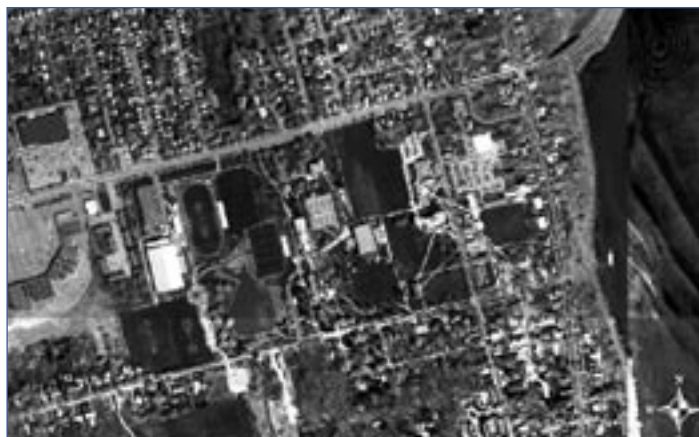
Image 1: Aerial Photo of Hobart and William Smith Colleges, courtesy of the New York State Office of Cyber Security and Critical Infrastructure Coordination (CSCIC).

Maps with images in them usually have an aesthetic value . Images provide a complexity of color that can be attractive to the human eye. Images can significantly enhance the successful communication of ideas in a visual presentation. The adage, "a picture is worth a thousand words" has been proven time and again in this genre of communication.