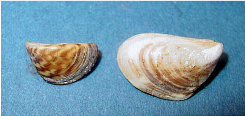
Zebra Mussel left Quagga Mussel right

While participating in Science on Seneca, students will see these mussels in the sediment dredge samples they collect. To distinguish the species you need to look closely at the hinge. Zebra mussels have a flat hinge and lay flat on the palm of your hand while the quagga's hinge is oval shaped and will tip. See the images below to view the different species.